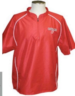
Rawlings On Deck Pullover

If you are ordering youth size t-shirts, standard sizing for t-shirt orders that are youth and adult shirts is not more than 11" wide or 12" tall. Please call for pricing if you prefer a larger print size on the adult t-shirts.