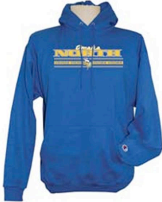
Champion Double Dry Action Fleece Hood

Description: This hooded sweatshirt comes in grey, and it has the logo below on the chest. Sweatshirt is 9oz. with a pocket in the front.