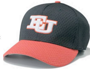
Richardson Pro Mesh Stretch Fitted Cap

This hat comes in two colors: Black with Red Bill and Red Button (see above), this is the Sophomore and Freshman hat Grey with Red bill and Red button, this is the Varsity hat