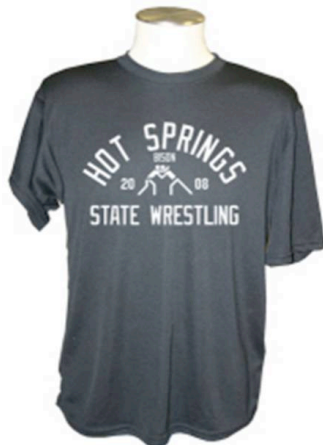
A4 team t-shirt

Description: This t-shirt comes in black, and it has the logo below, across the chest. It is made from 100% polyester with 3M moisture management system.