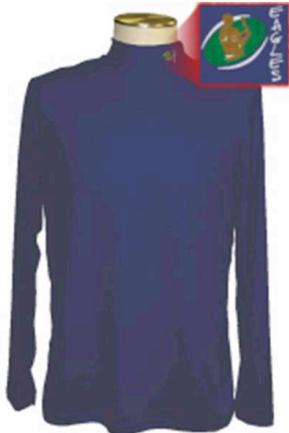
A4 Mock Turtleneck

Description: This mock turtleneck comes in black, and it has the logo below, on the neck. It is made from 100% polyester with 3M moisture management system.