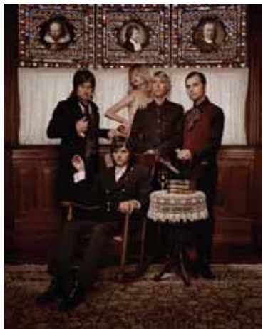
Louis XIV publicity photo by Jennifer Tzar

• The Villa has always been associated with music, and this year the Villa got the star treatment by local San Diego band Louis XIV . (If you've not heard of them, your kids or grandkids probably have!) The band could have picked anywhere for the publicity shots for their new CD released in January 2008, but