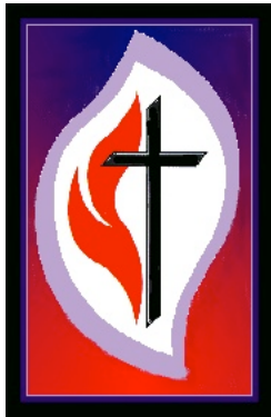
United Methodist Women