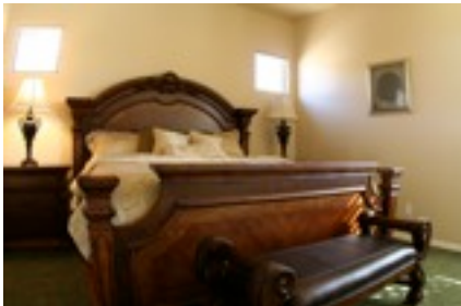
2ND MASTER SUITE

This bedroom features private bathroom and King bed.