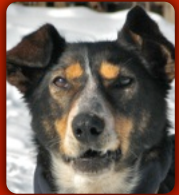
Happy is sponsored by a Happy fan for Happy dogs everywhere!