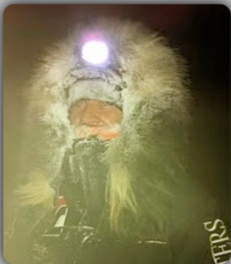
Allen at 50 Degrees Below Zero on the Yukon Quest

SP Kennel had three teams in the Copper Basin 300 Sled Dog Race in January. The Red Team had a Top Ten finish (9th) out of the 51 teams entered. The Black Team crossed the finish line in 16th place and the R&B Team took 30th. Thirty-six SP Kennel dogs competed in the event.