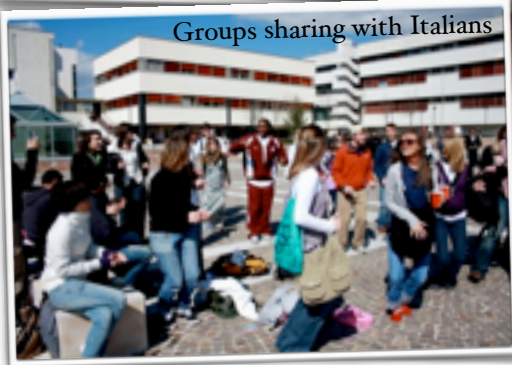
Groups sharing with Italians