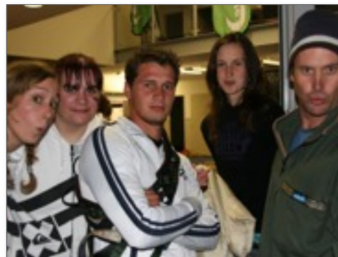
Volunteer helpers at grand opening

For more information on costs, programmes, events or booking one or all of our rooms, please call the office on 03 354 9381 or email office@pyd.org.nz