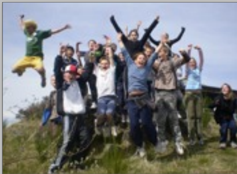
Young people on the Casebrook Cruisers holiday programme

Te Koru will primarily run programmes and events aimed at intermediate and high school aged young people. However, this is a community facility, and we hope that people of all ages and backgrounds will feel welcome and be able to use this awesome resource in some way. Our facilities are available for hire by everyone in the community, but priority will be given to bookings that benefit the city's young people.