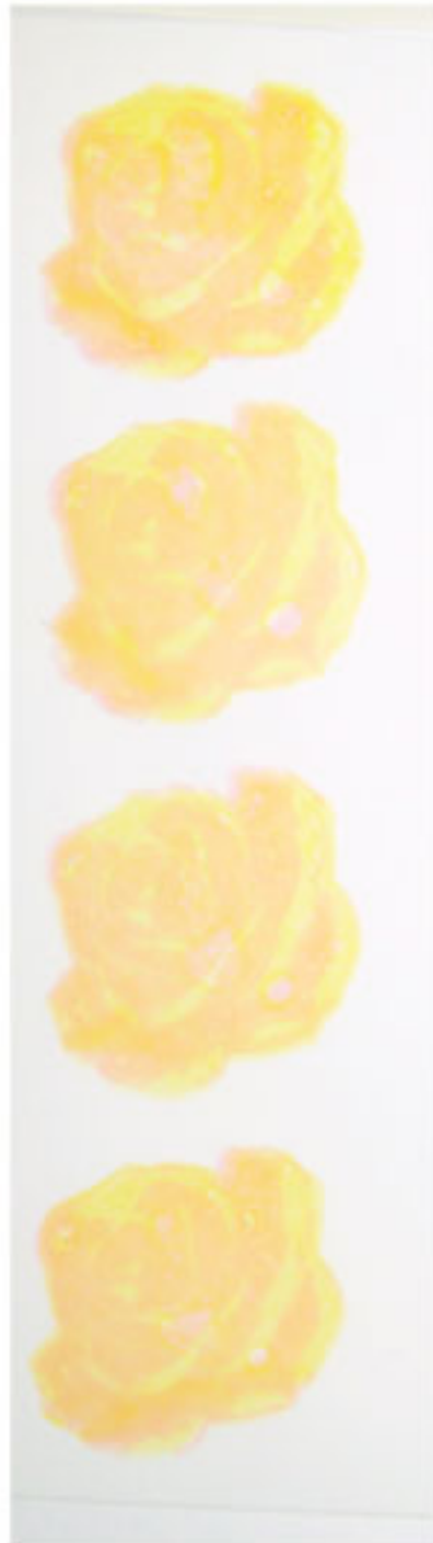
Step #2 Pretty in Pink