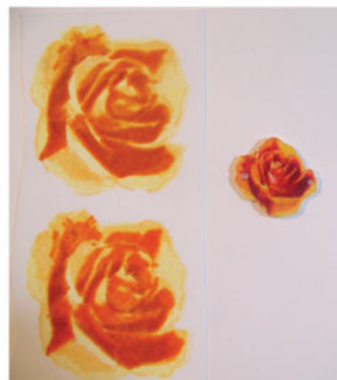
Size proportion of Large rose stamped to rose after being heat shrunk.