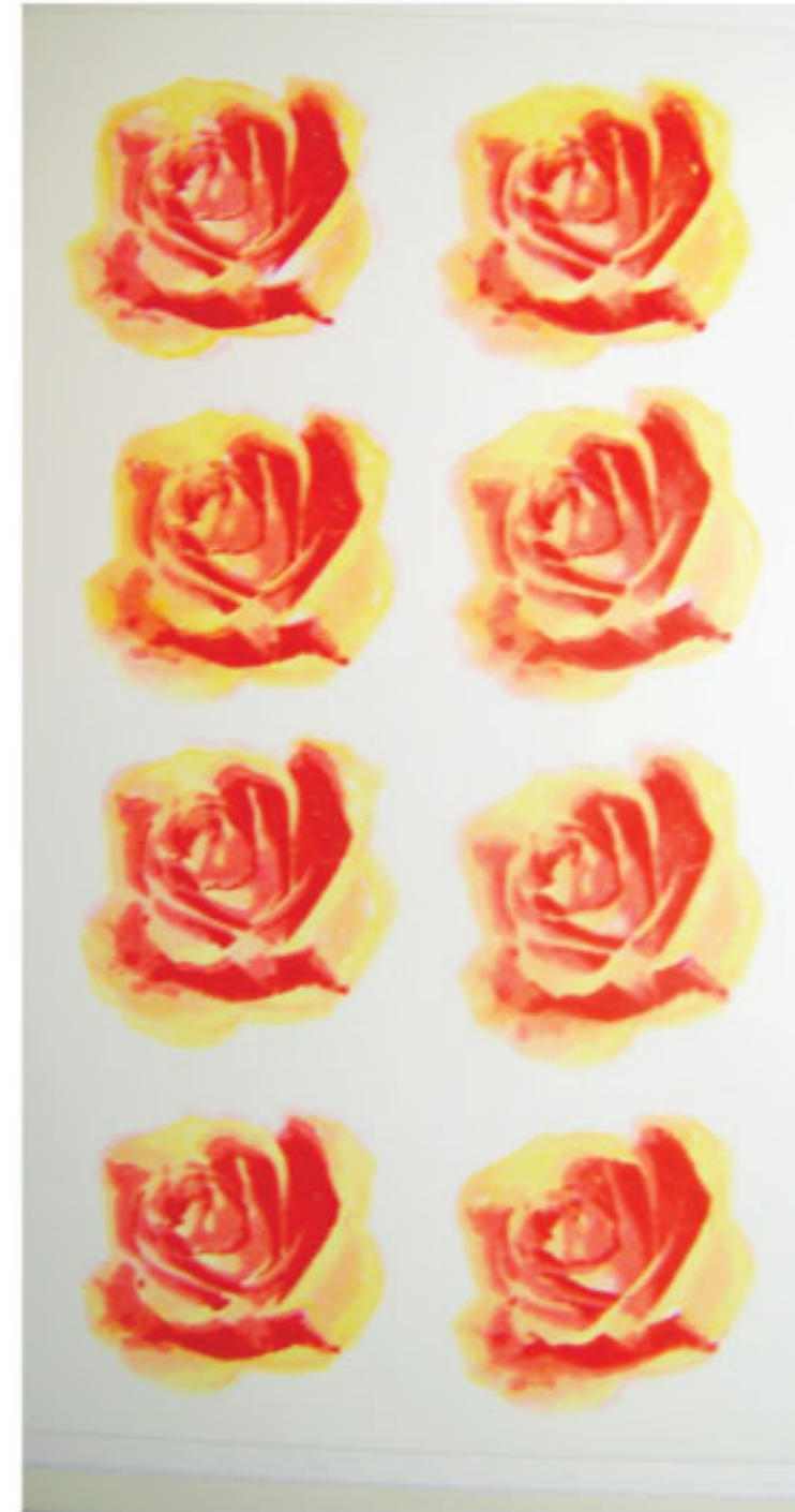
Step #4 Riding Hood Red