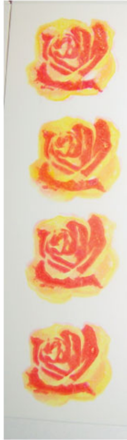
Step #3 Regal Rose