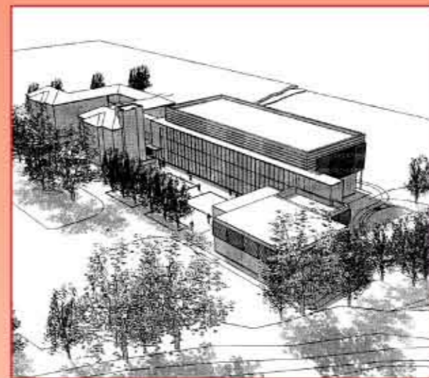
The new Performing Arts Centre, MMU

A published author on teaching Shakespeare, Priscilla is delighted to be involved in the very first QIPSSs. She hopes you will all come ready to learn but above all to have fun!