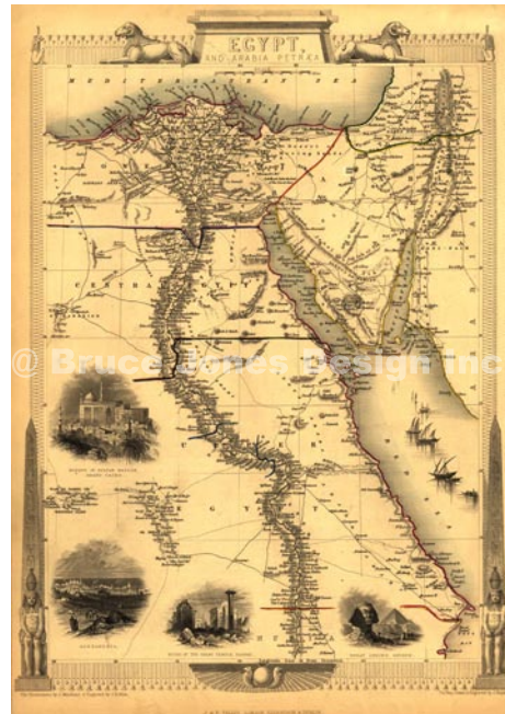
Egypt 18-- (also in the Middle East Folder)