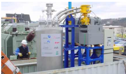
Distribution Voltage Fault Current Limiter demonstrated successfully by the EC-funded CURL10 project.

The benefits of High-Temperature Superconductivity have not escaped the attention of others. Maritime interests have also involved themselves in the development. A European project to develop a shipboard fault current limiter is underway, as well as other projects in Europe, Japan and the USA to develop ship motors and generators. The most powerful (36.5 MW) of these is being built for the US Navy.