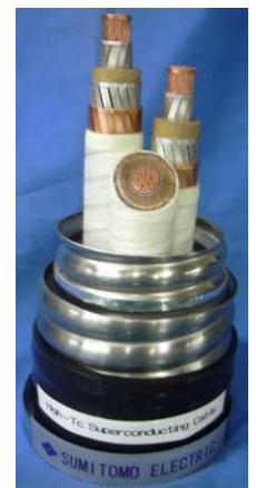
Sumitomo's HTS "triplex cable"

Concerns over the environmental impacts of either hydro-carbons or fissionable material (i.e., uranium and plutonium), which fuel conventional generating stations, prompt governments to fund research and development for the long term success of fusion, a technology that depends on superconductivity. Others seek nearer term alternatives from renewable energy, particularly the near-term generation of electric power by wind. Europe has led the way in demonstrating