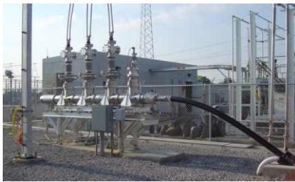
On 8 August, 2006, a Southwire-NKT collaboration began demonstrating a prototype HTS cable (3 kA, 13.2 kV) of new design on the grid in Columbus, Ohio.

wind's technical feasibility but wind remains more expensive and less reliable than conventional generation. A key to greater use is lowering cost by building more powerful off-shore wind turbines. High-Temperature Superconductors offer the prospect of lighter, more powerful generators that can be supported by today's off-shore infrastructure thus, lowering the cost of the project and so reducing the cost of electricity from wind. Indeed, a European project is underway to explore this attractive possibility.