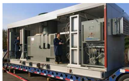
HTS enables smaller, lighter, more efficient rotating machines (motors, generators and synchronous compensators) with hitherto unattainable performance. After years of tests, TVA ordered several of AMSC's SuperVar machines to increase the stability and power quality on TVA's system.

Yet much remains to be accomplished. Young engineers and scientists must be funded to advance the field. They must continue to improve performance and lower cost before the promise of High-Temperature Superconductivity can be realized in commercial applications.