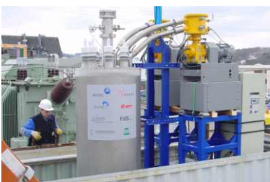
Distribution Voltage Fault Current Limiter demonstrated successfully by the EC-funded CURLIO project.

The benefits of High-Temperature Superconductivity have not escaped the attention of others. Maritime interests have also involved themselves in the development. A European project to develop a shipboard fault current limiter is underway, as well as other projects in Europe, Japan and the USA to develop ship motors and generators. The most powerful (36.5 MW) of these is being built for the US Navy.