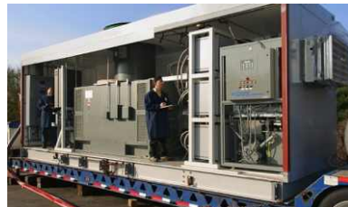
HTS enables smaller, lighter, more efficient rotating machines (motors, generators and synchronous compensators) with hitherto unattainable performance. After years of tests, TVA ordered several of AMSC's SuperVar machines to increase the stability and power quality on TVA's system.

Yet much remains to be accomplished. Young engineers and scientists must be funded to advance the field. They must continue to improve performance and lower cost before the promise of High-Temperature Superconductivity can be realized in commercial applications.