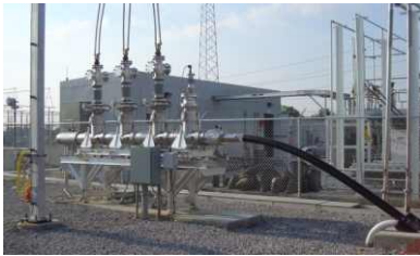
On 8 August 2006, a Southwire-NKT collaboration began demonstrating a prototype HTS cable (3 kA, 13.2 kV) of new design on the grid in Columbus, Ohio.

wind remains more expensive and less reliable than conventional generation. A key to greater use is lowering cost by building more powerful off-shore wind turbines. High-Temperature Superconductors offer the prospect of lighter, more powerful generators that can be supported by today's off-shore infrastructure thus, lowering the cost of the project and so reducing the cost of electricity from wind. Indeed, a European project is underway to explore this attractive possibility.