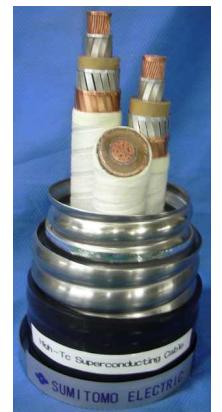
Sumitomo's HTS "triplex cable"

densely populated cities where space is limited and valuable, and concerns with environment, safety and health are paramount. Indeed, prototype High-Temperature Superconducting transmission cables are being developed and tested in China, Korea, Japan, Western Europe, Russia and the US, where three different demonstration cables now provide electricity to homes, commercial, and light industrial buildings.